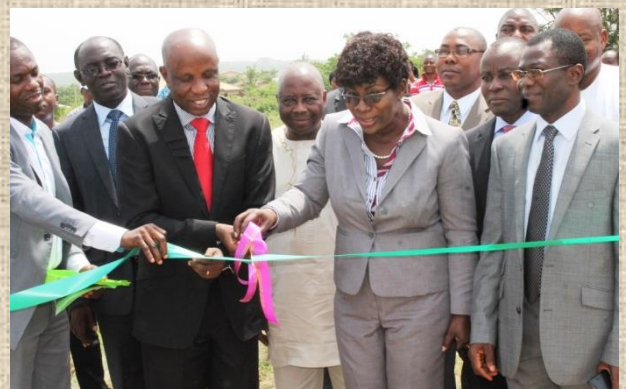
The dignitaries cut the official launch ribbon