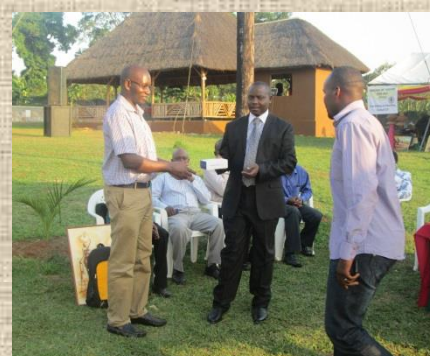
Winners being rewarded by the guest of honour, Mr Ronald Kibuule, State Minister for Water, Resources