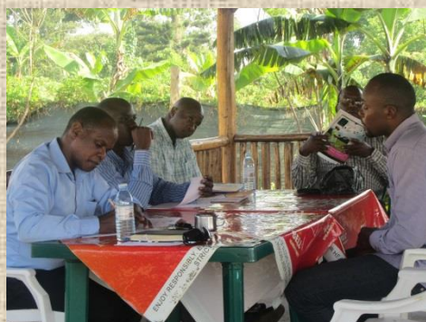
Youth participate actively in the Agri-Biz Idol Camp (above)