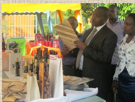
The State Minister of Youth, Mr Ronald Kibuul, looks at products on display at the fair.