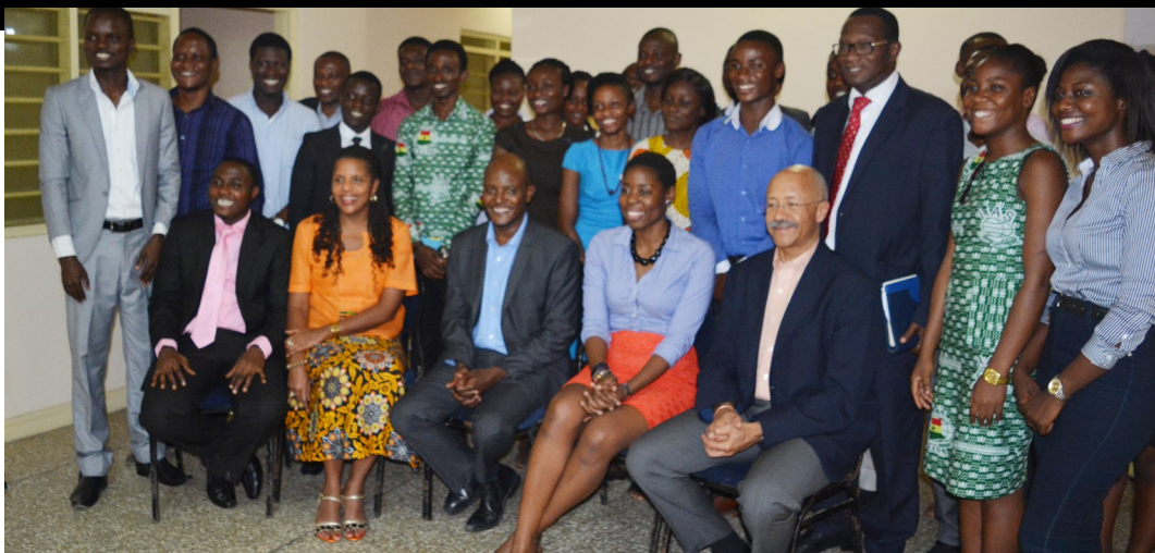
AYNAT, Africa Lead II and IAAS representatives at the opening pitch sessions.

The collaboration between the USAID Africa Lead II Programme and AAIN in support of the African Youth Network for Agricultural Transformation (AYNAT) to build a new agribusiness incubator produced the GrowShort incubator. At the first pitch session, the youth also entered an MoU with the University of Ghana Chapter of the International Association for Students of Agriculture and Related Sciences (IAAS).