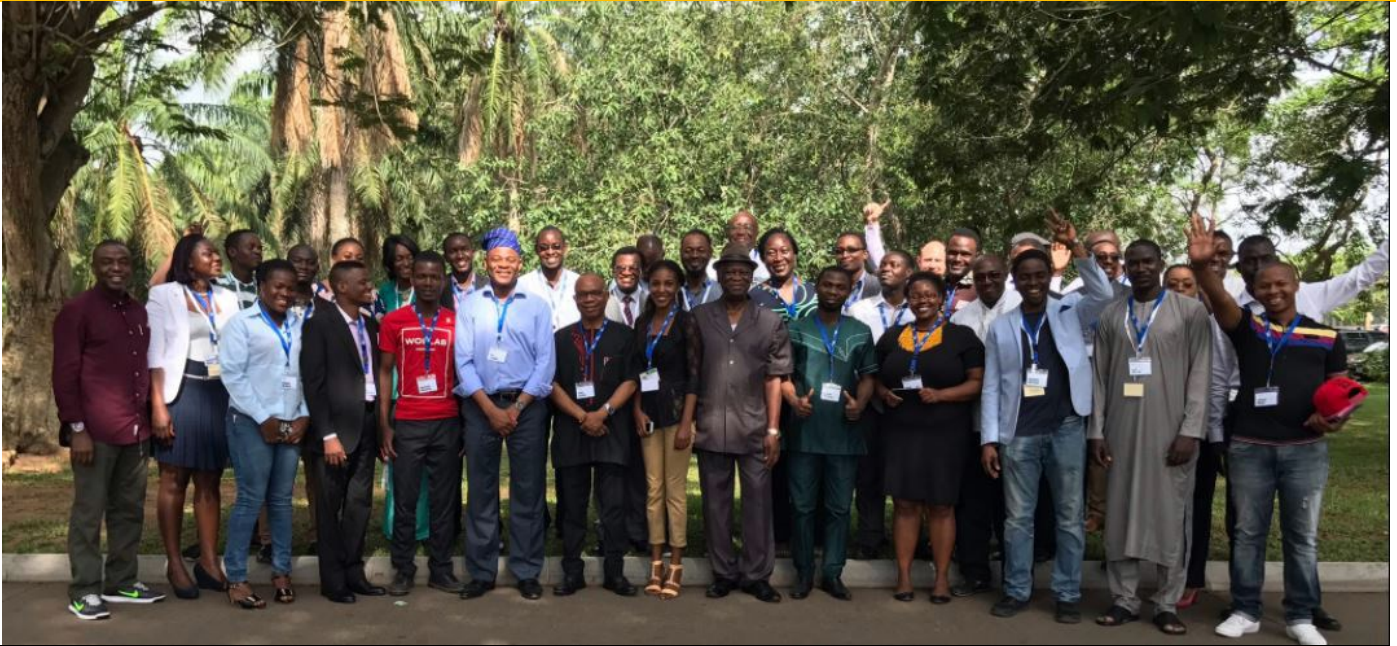
Some of the youth and facilitators who attended the pre-event session and agri-pitch competition led by CTA.