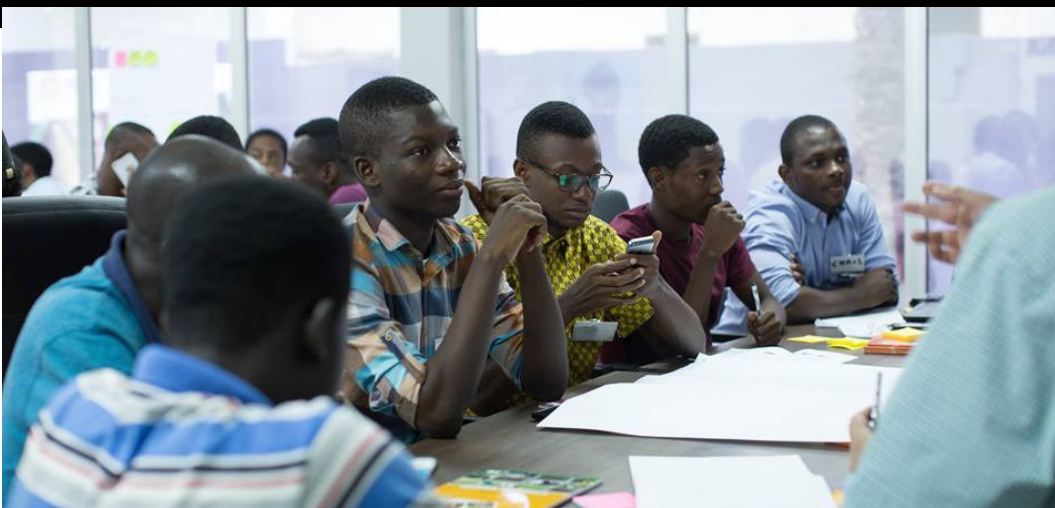
Teams were formed to complete innovations for the Cocoa Value Chain of Ghana.

The “Knowledge sharing” segment of the 2017 Ghana Chocothon was designed to empower and connect the Ghanaian cocoa farmers through a shared value sustainable cocoa supply chain platform.