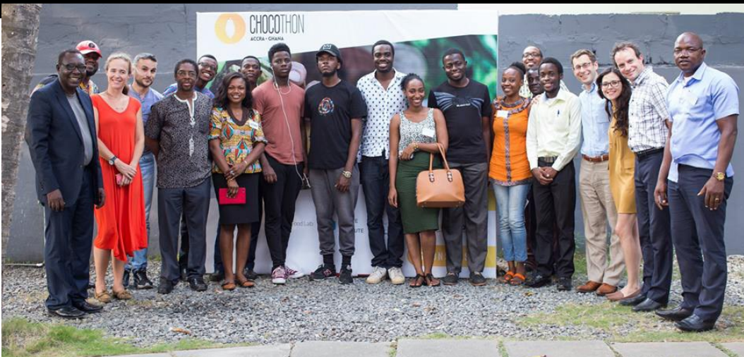
Ghana Chocothon 2017 facilitators and innovators of Cocoa Value Chain solutions in January.

The Ghana Chocothon, a series of events aimed at empowering and linking cocoa value chain stakeholders at the Impact Hub in Accra, Ghana highlighted major gaps that require solutions.