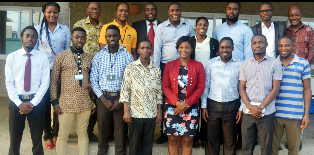
Ghana Chocothon 2017 facilitators and innovators of Cocoa Value Chain solutions in January.

The joint input of AAIN and the Africa Lead Programme of USAID, a major player in empowering youth through agribusiness and agro-based entrepreneurship built the foundation for the training and put the youth leaders on track to open a value chain incubator in Accra.