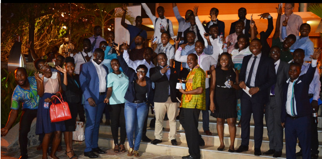
A section of the more than 40 entrepreneurs that participated in the launch.

In a bid to spur investment in entrepreneurship in the Netherlands and Ghana, the Dutch Embassy in Ghana has hosted a kick-off event of the Growing Business Together (GBT) project at a B2B event this evening that was attended by diplomats, entrepreneurs and investors who were joined by representatives of the African Agribusiness Incubators Network.