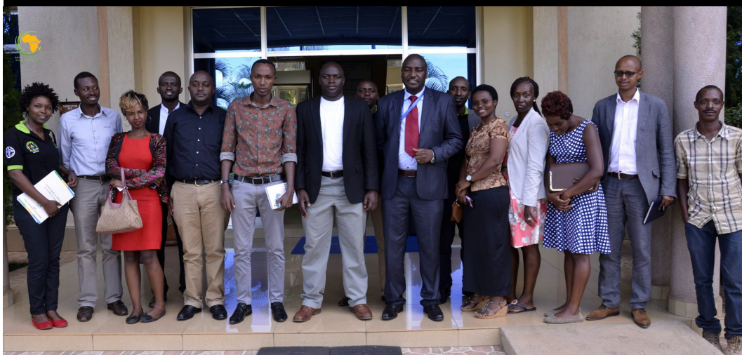
RYAF and AAIN representatives in a group photo after the official signing in Kigali, Rwanda.

With a high demand for the replication of success from agribusiness incubation in Africa, the Rwanda Youth in Agribusiness Forum (RYAF) signed an MoU with the African Agribusiness Incubators Network on Tuesday to enhance job creation in Rwanda.