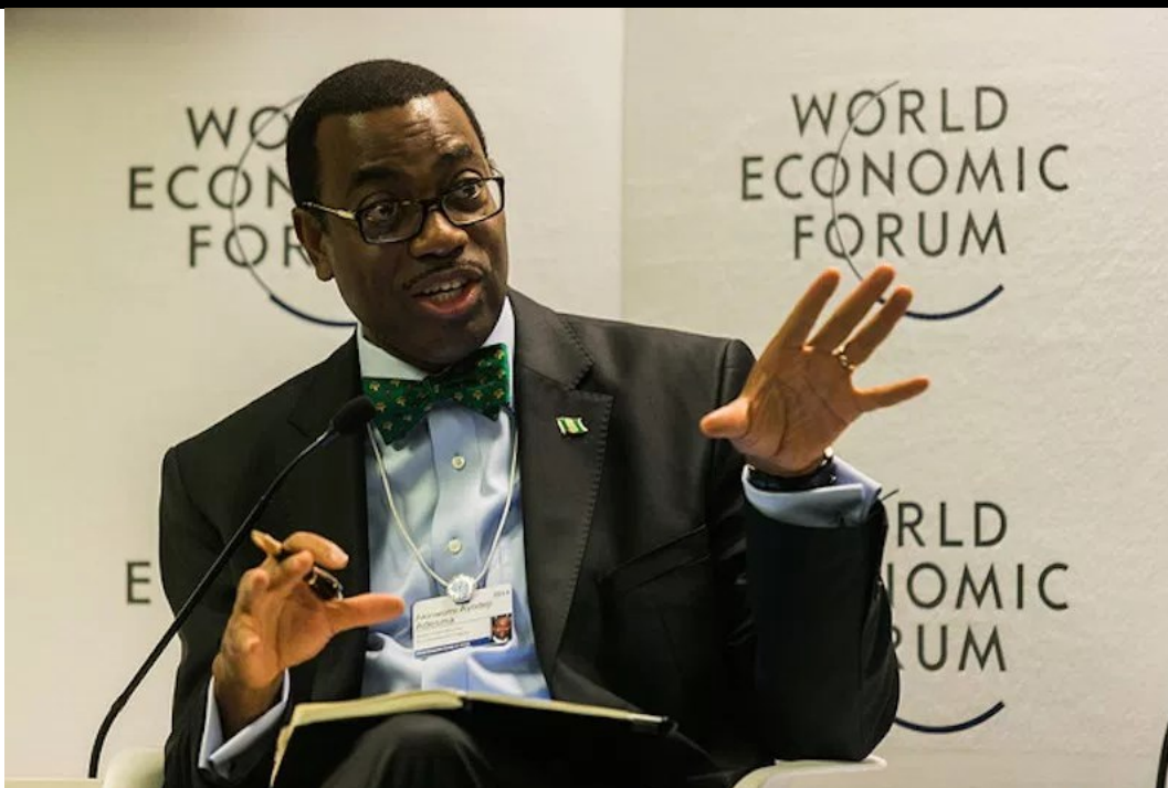
AfDB President Dr. Akinwumi Adesina at a past event of the World Economic Forum

Dr. Adesina received a US$250,000 prize from the World Food Prize Foundation for his leading role for the past 25 years significantly expanding food production in Nigeria; introducing initiatives to exponentially increase the availability of credit for smallholder farmers across the African continent and galvanizing the political will to transform African agriculture.