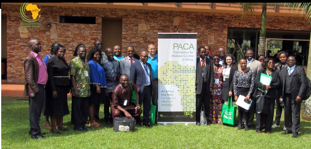
Participants of the PACA event in Kampala on the 31st of May, 2017.

In a multi-stakeholder side event at the 13th Partnership Platform of the African Union Comprehensive African Agriculture Development Programme (CAADP) in Kampala, Uganda from the 31st of May to the 2nd of June 2017, the African Union Partnership for Aflatoxin Control in Africa (PACA) revealed new strategies to control the growing effects of aflatoxins in Africa.