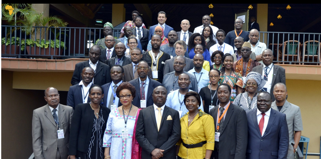
Participants at the African Union CAADP Platform 2017 in Entebbe, Uganda.

By the 12 th CAADP Partnership Platform in Accra Ghana in April of 2016, the campaign for increased investment in Africa's youth-led SMEs was in high gear among partner organizations.