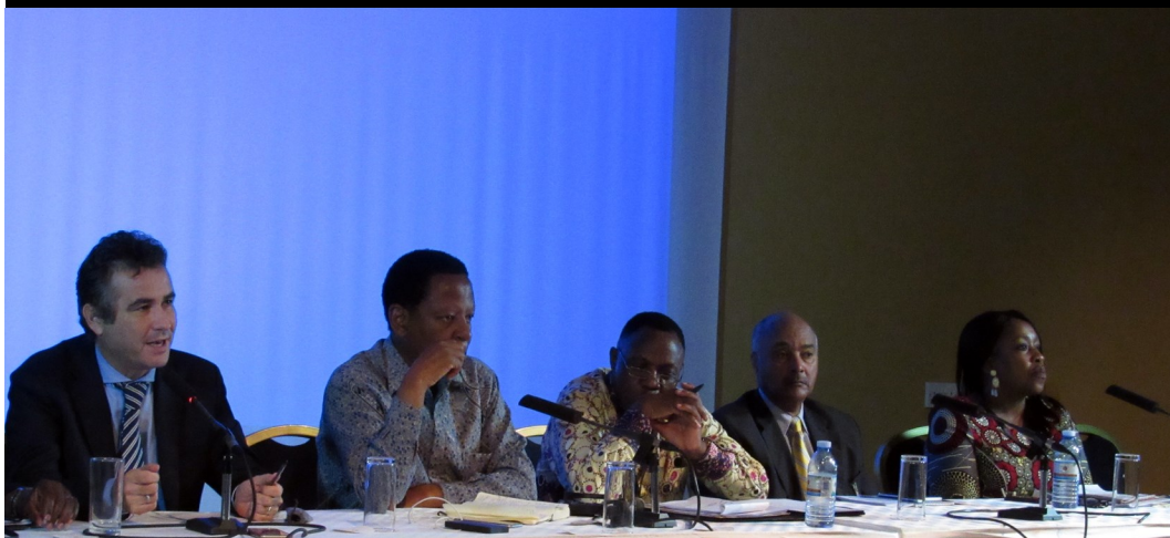
The lead panel at the breakout session on “Tools, instruments and mechanisms for private sector involvement in agricultural value chains” for the 13th CAADP PP in Kampala, Uganda.

The 13 th Comprehensive African Agriculture Development Programme (CAADP) Partnership Platform of the African Union held in Kampala, Uganda from 31 st May to 2 nd June, 2017 highlighted the potential of the youth, the private sector and vehicles like agribusiness incubation in transforming African agriculture.