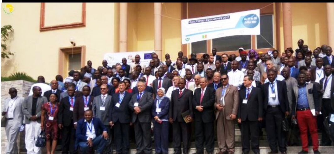
A selection of participants and the historical climax in Dakar, Senegal.

A representative group out of over 500 youth is set to take Africa's livestock sub sector to the next level.