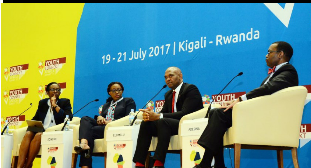
The panel on job creation for the 2020 target of 50 million jobs at the Summit in Kigali.

The Rwandan capital, Kigali was host to over 2500 delegates for the 2017 Youth Connekt Africa Summit from the 19th to the 21st of July organized by the Rwandan ICT Ministry and a host of partners.